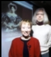
University of Alberta

Handout: Press Notices from University of Alberta's Folio and CBC