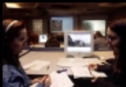
Beta Delivery of AMICO Library to 16 campuses